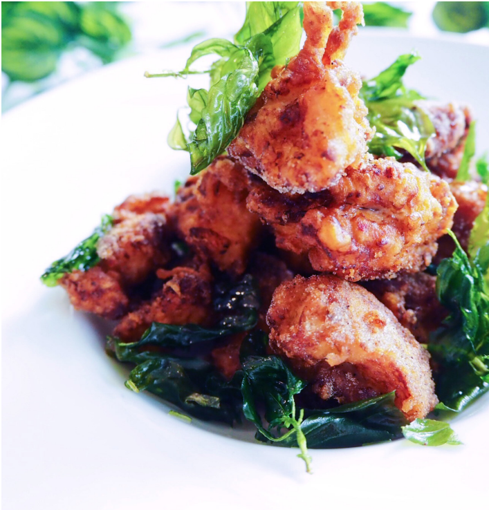
Taiwanese Chicken Bites