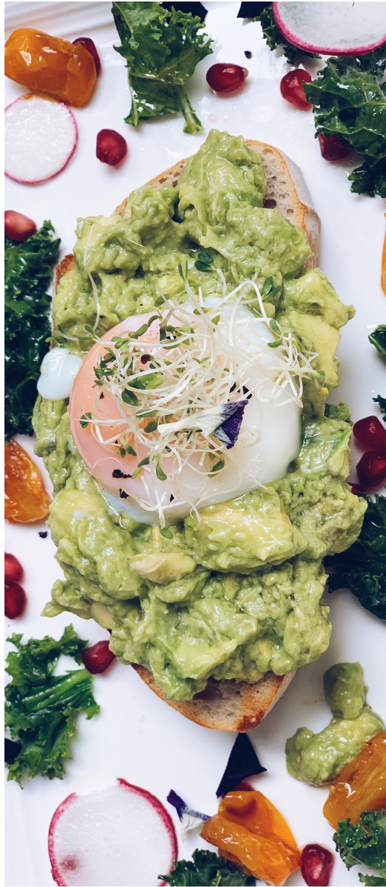
Avocado Toast w/ Egg