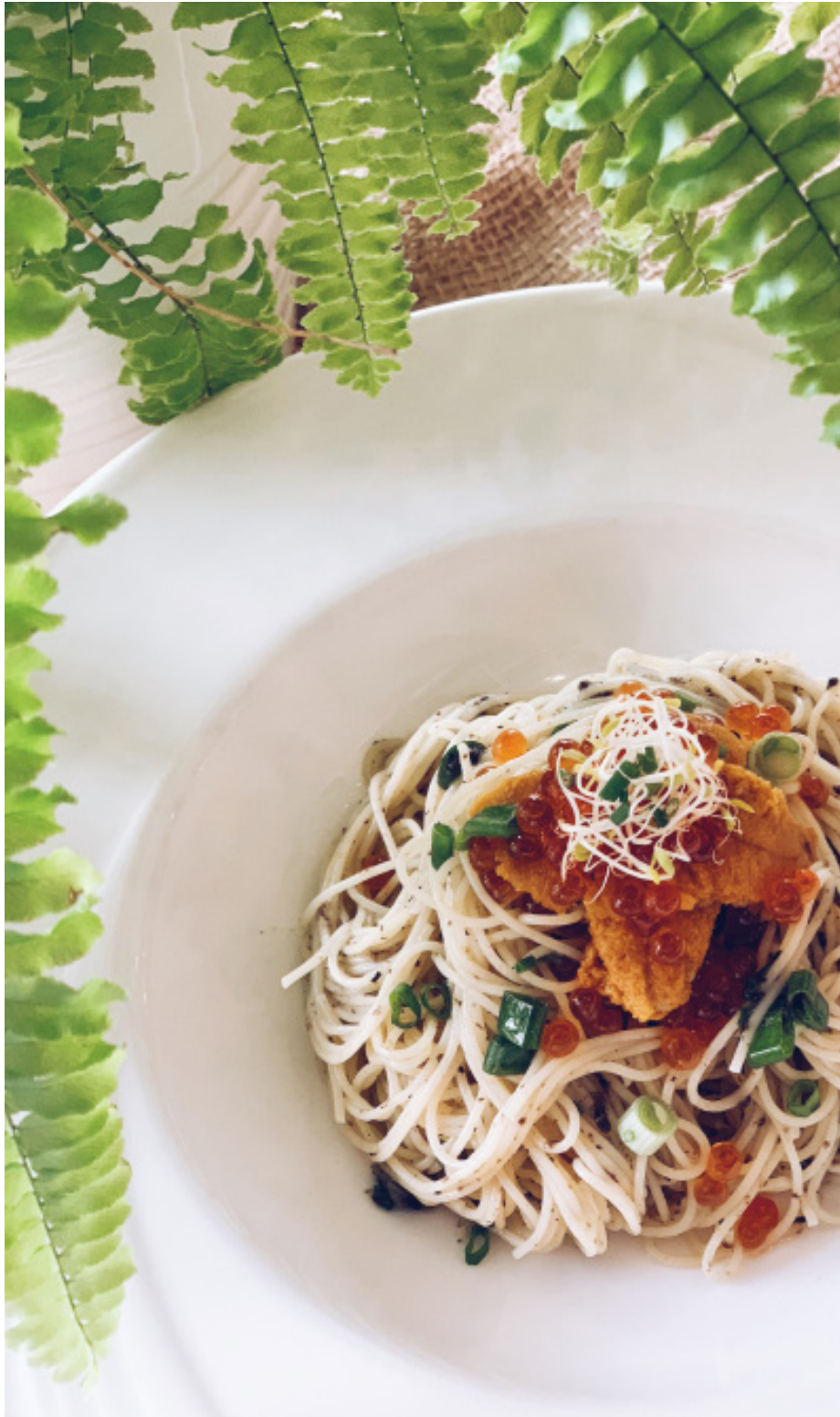
Uni Truffle Spaghetti