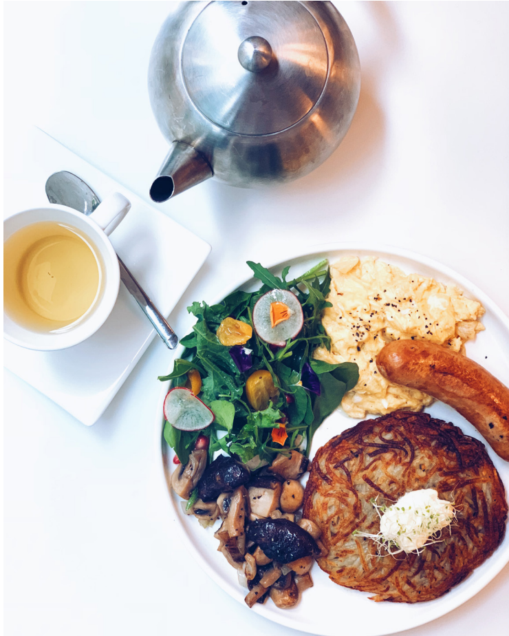
BOTANY Signature DIY Breakfast