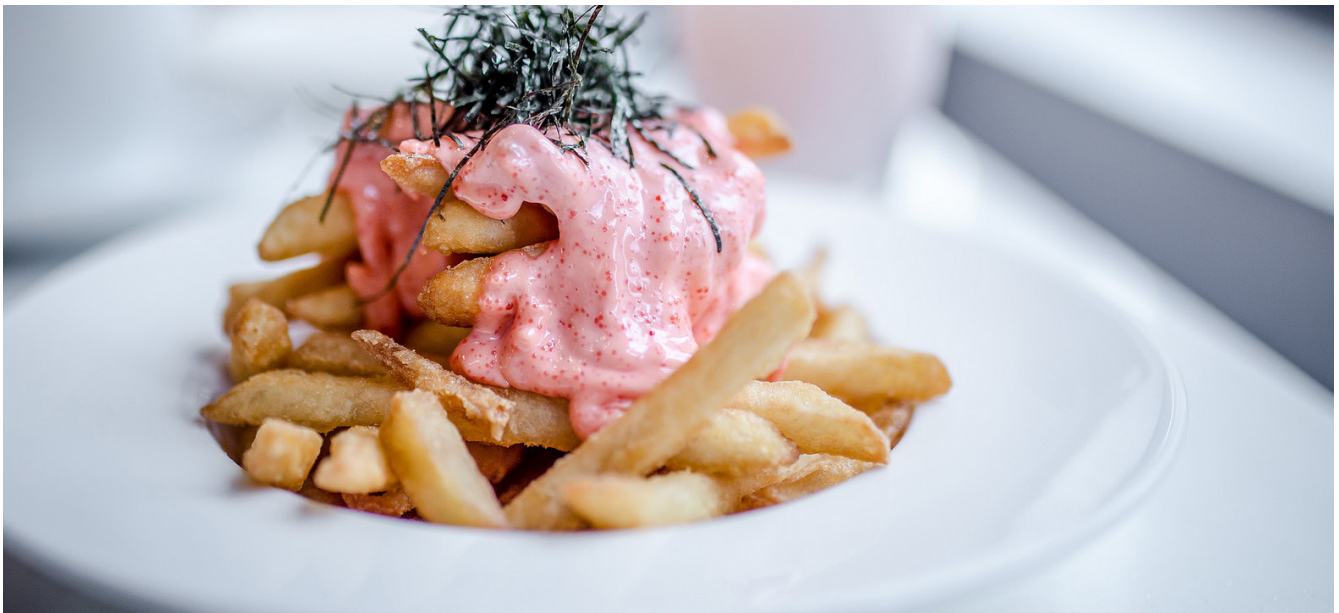
Signature Mentaiko Fries