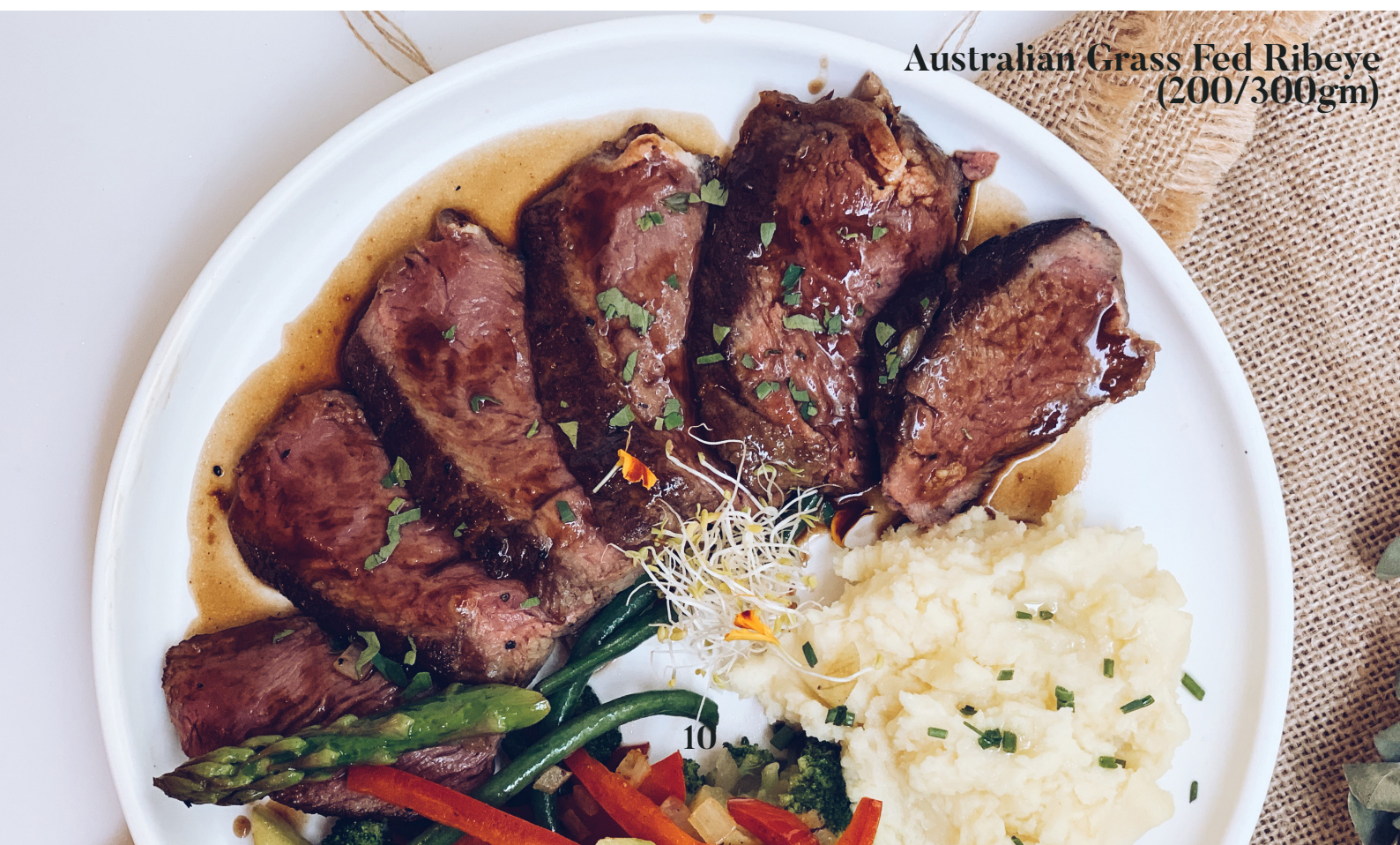
Australian Grass Fed Ribeye (200/300gm)