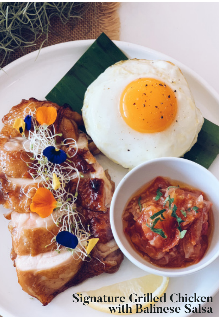
Signature Grilled Chicken with Balinese Salsa