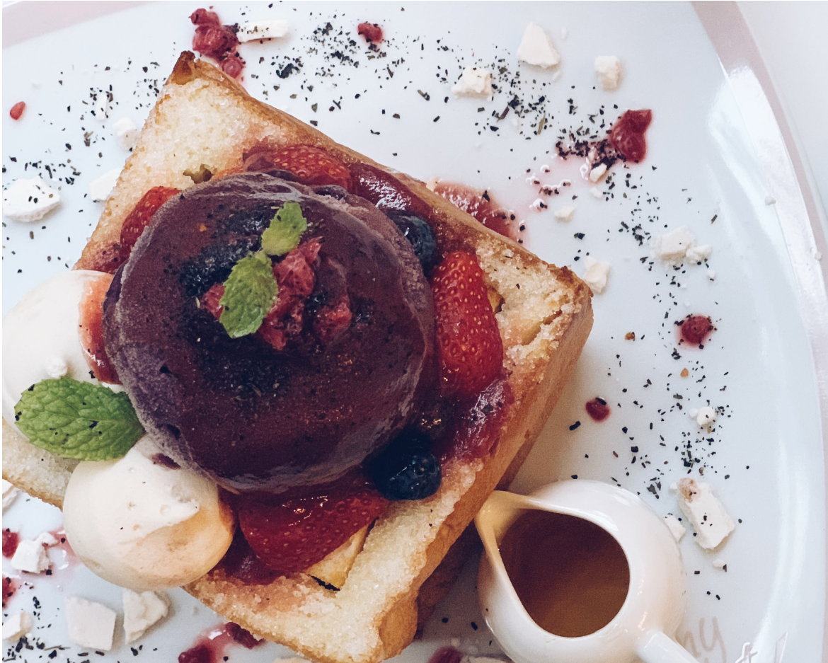
Dazzling Cafe's Signature Honey Toast (Acai Berry)