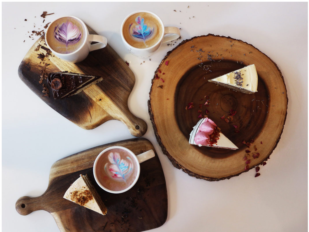
Artisan Cakes from Creme Maison