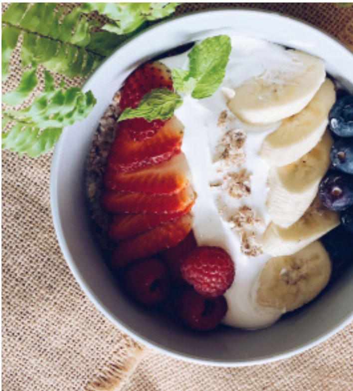
Homemade Muesli Bowl