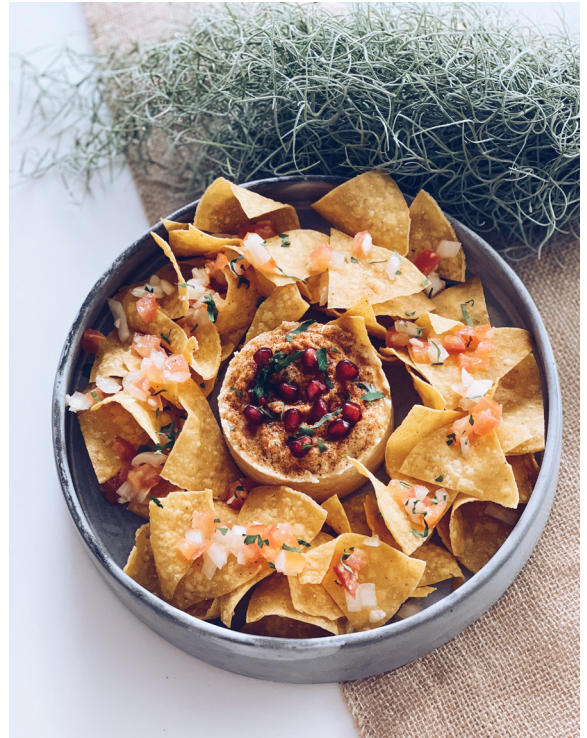
Hummus with Baked Nachos